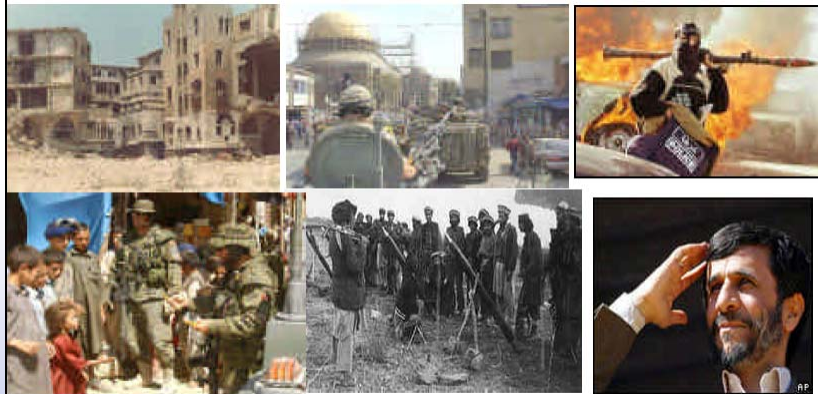
Threat – more complex/dynamic/TIM's/smaller in scale Iran Mahmoud Ahmadinejad